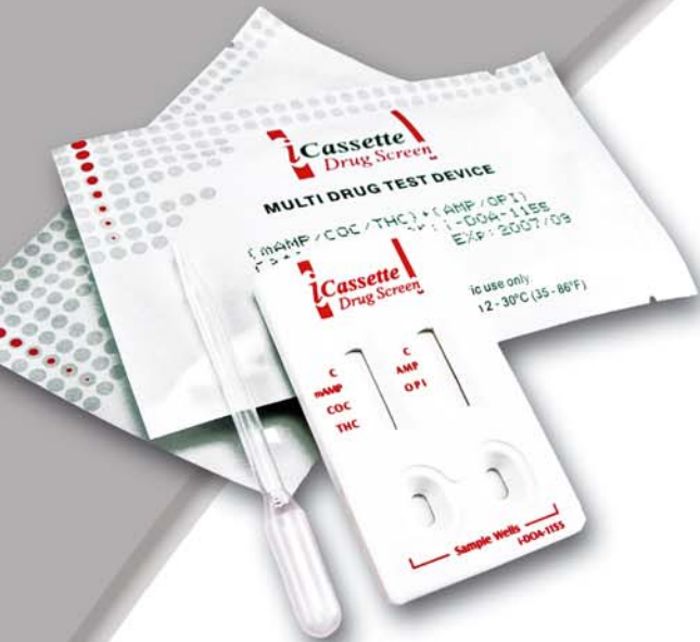
CLIA Waived iCassette 5 panel shown above.

Detect the presence of drugs in minutes. It's drug testing efficiency you can count on.